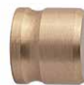
15mm (for Acrylic Pole)