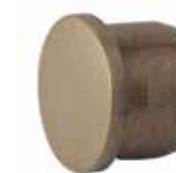
End Cap Short