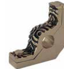
Estilo Articulated Alta