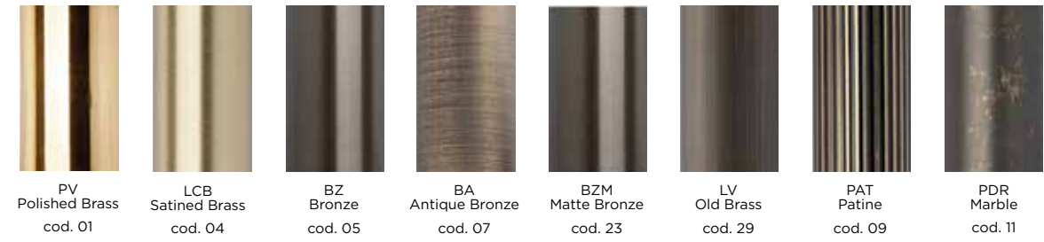
PV Polished Brass cod. 01 LCB Satined Brass cod. 04 BZ Bronze cod. 05 BA Antique Bronze cod. 07 BZM Matte Bronze cod. 23 LV Old Brass cod. 29 PAT Patine cod. 09 PDR Marble cod. 11