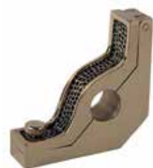
Clássica Articulated Alta