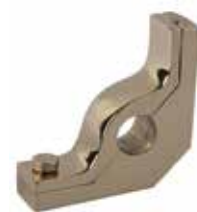
Lisa Articulated Alta