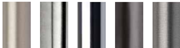
NC Matte Satined Nickel cod. 33 NCB Brilliant Satined Nickel cod. 31 CRO Chrome cod. 38 GRAF Matte Graphite cod. 24 EST Gunmetal cod. 20